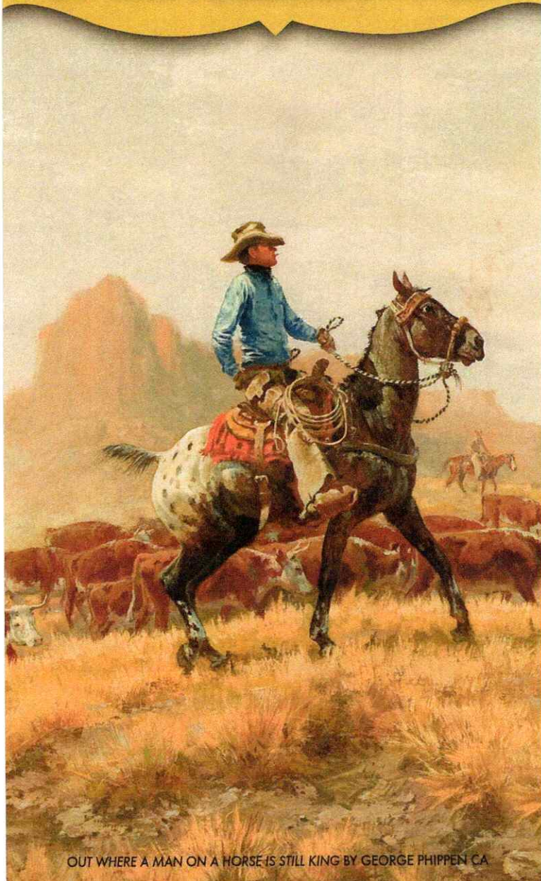
OUT WHERE A MAN ON A HORSE IS STILL KING BY GEORGE PHIPPEN CA

PRESCOTT ♦ ARIZONA JUST 7 MILES FROM DOWNTOWN!